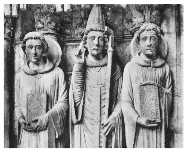
Statues of Saints Etienne, Clement, and Lawrence on the exterior of the Cathedral of Chartres, France, dating from the 13th century

"Canon law is binding on all the faithful as an expression of the beart and mind of our Lord."